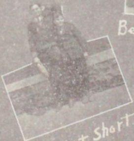
Longt short of IT