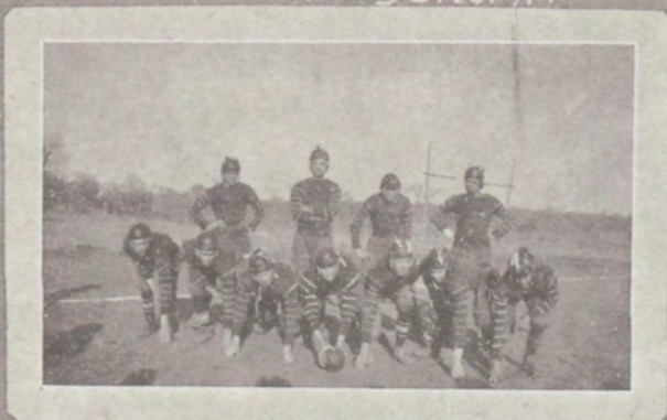
A Hard BUNCH