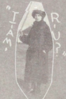
"T- -MAY- R- -UP?"