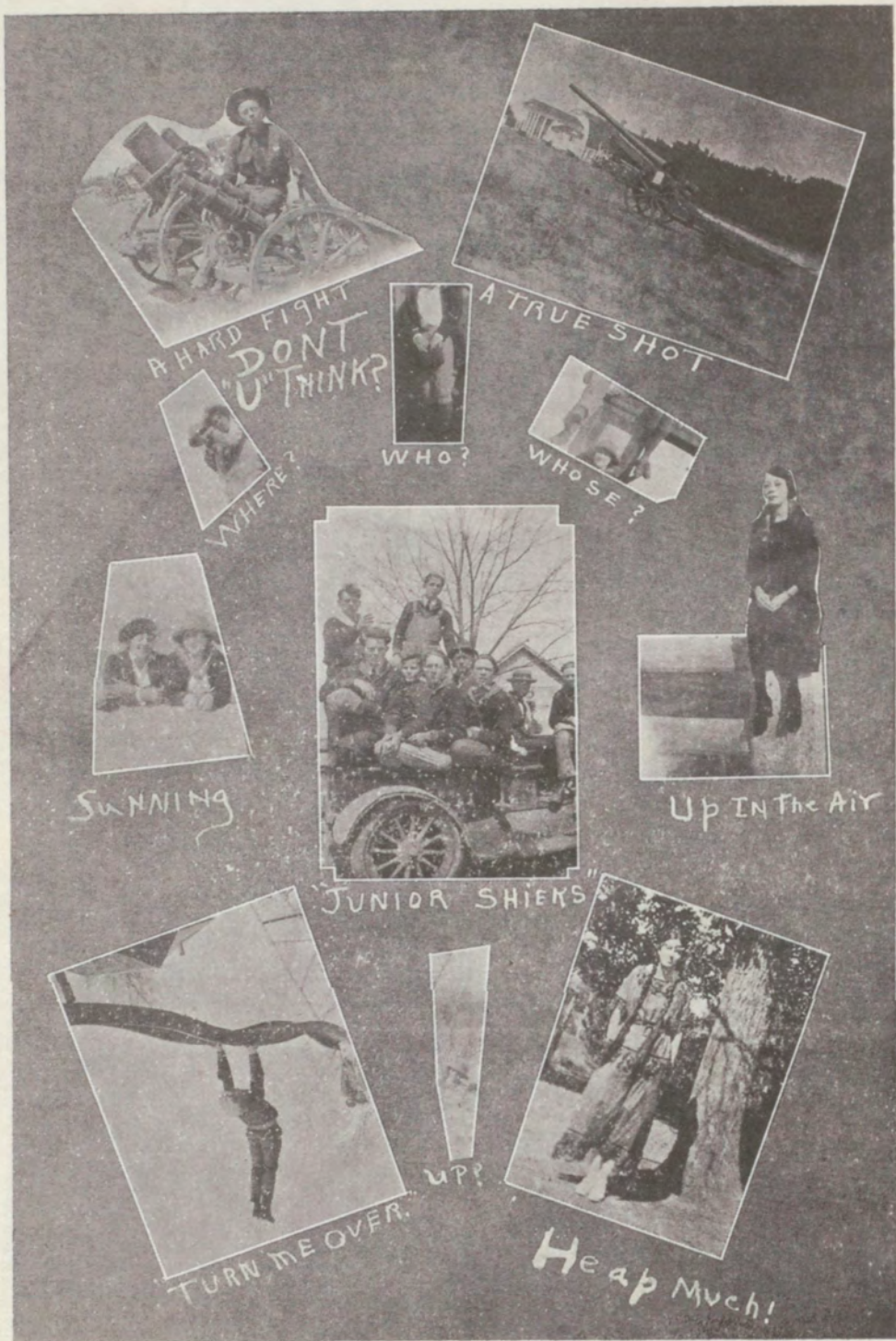
A HARD FIGHT DONT U THINK?