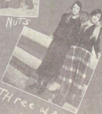
Three of a kind