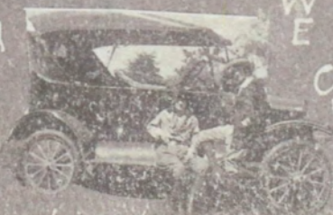
WHO LET 'EM OUT